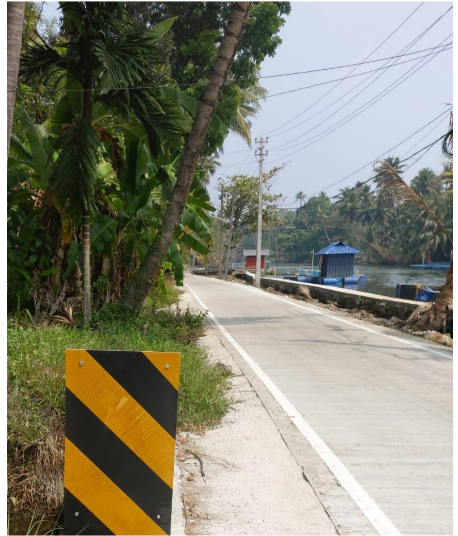
Panjam Kavala Road- EKM