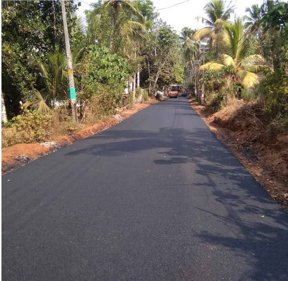
Thandilam Manali Kecheri Road - Thrissur