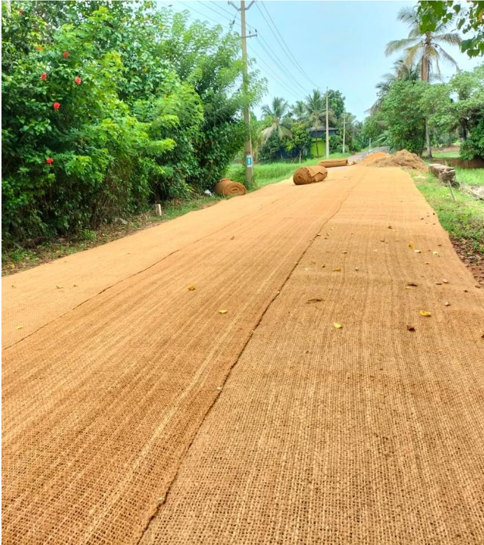
AC Canal Mankuzhi Road - ALP