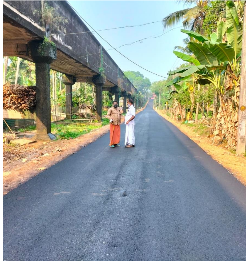
Pennukkara Canal Road - ALP