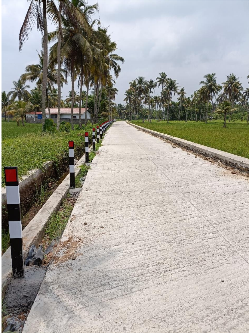
Thadikadavu Vayalodam Road - EKM