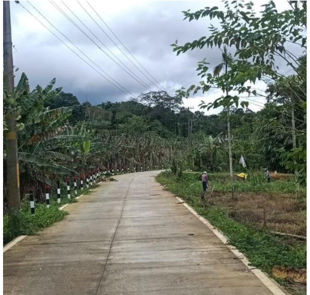
Chakram Colony Road – Wayanad